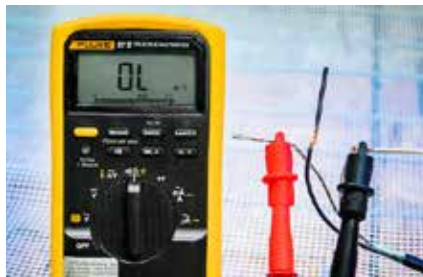
Figure 2. Confirm no continuity to ground wire.