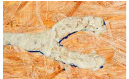
Figure 7. These pockets ensure the thinnest, flattest installation.