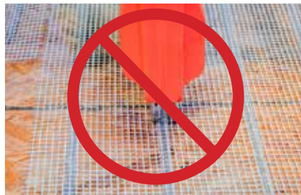
Figure 10. Staple through fabric only. DO NOT staple into or across the heating wires or cold lead.