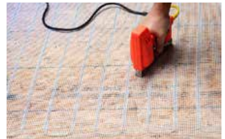
Figure 11. Staple in a grid pattern, no more than 12" apart.

* For concrete floors, Gold Heat mats can be anchored with any fast-setting adhesive, tape, or concrete floor fastener.