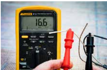
Figure 1. Verify that resistance matches the value on the product label.