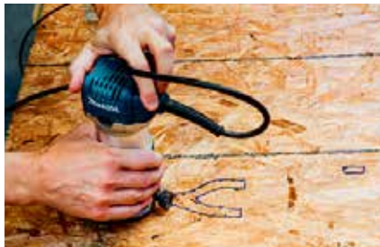
Figure 6. Use a router or chisel to relieve the subfloor 1/4" deep.