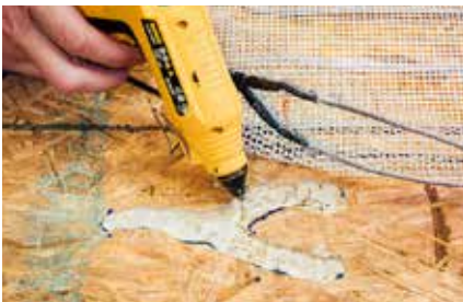
Figure 9. Secure the cold lead and cold lead splice to subfloor.