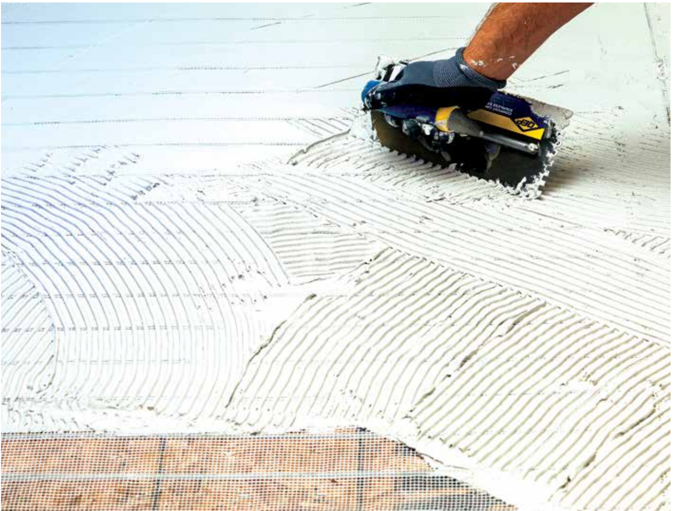
Figure 12. Press the setting compound through the fabric mesh to wet out the sub-floor, then add compound as necessary and comb up a setting bed.