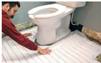
Take your mat out-of-the-box and adhere to subfloor