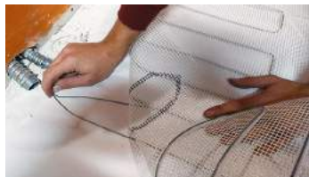
Connect sensor / test