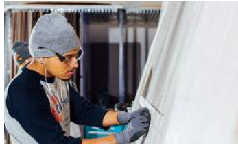
Mat build and QC