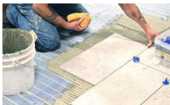
Install tile flooring