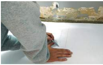
Submit your floorplan