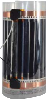
Your pre-measured, pre-terminated Black Gold film strips