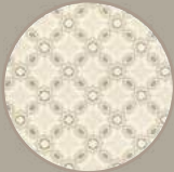
Sheet vinyl/ Linoleum