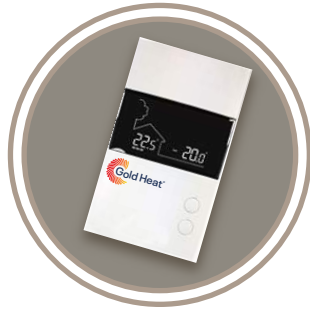
Thermostat that includes a floor heat sensor