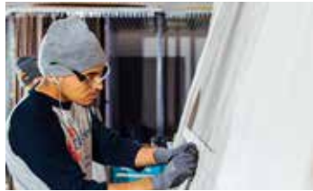
Mat build and QC