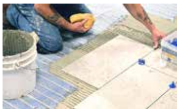
Install tile flooring