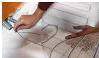
Connect sensor / test