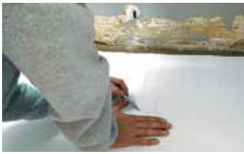
Submit your floor plan