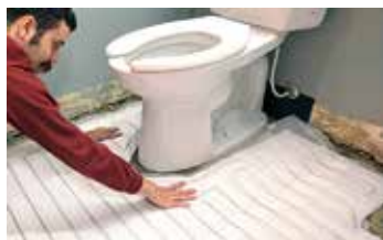
Take your mat out-of-the-box and adhere to subfloor